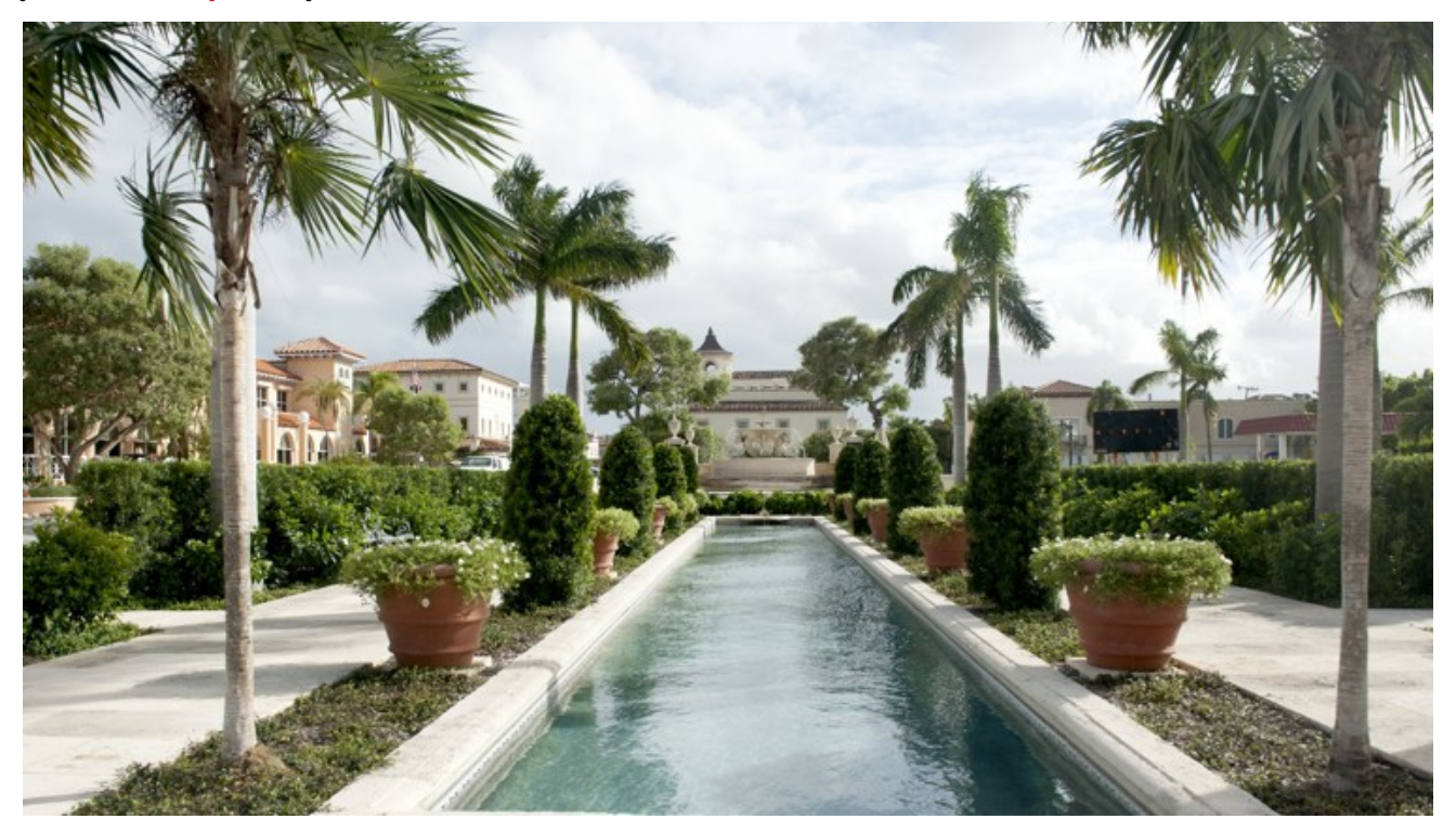
New palms grace Memorial Fountain and Town Square in Palm Beach, pictured in October.